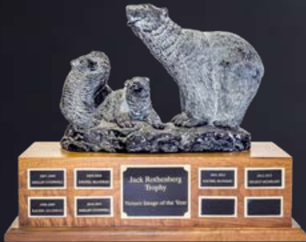
Image selected as the best Nature Image of the year, chosen from the best of the Botany, Nature General, Ornithology or Zoology categories.